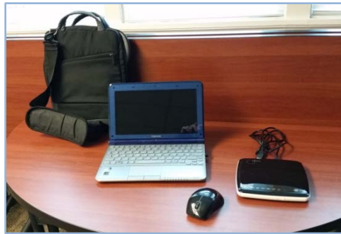
Walk Across America Grand Prize Package: Refurbished Toshiba Mini NB305 Netbook

Prizes for TRI's Walk Across America Challenge will be awarded by raffle drawing so that all who are participating for prizes will have an equal chance at winning.